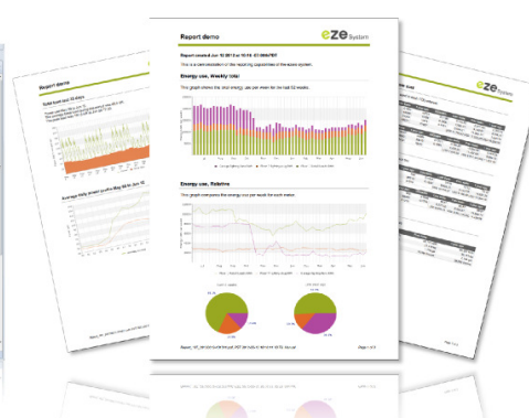
Automatic PDF reports