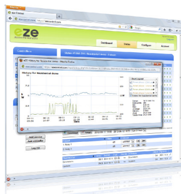
Real time web interface